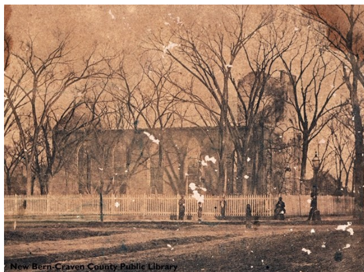
Ruins of Christ Episcopal Church, c.1871