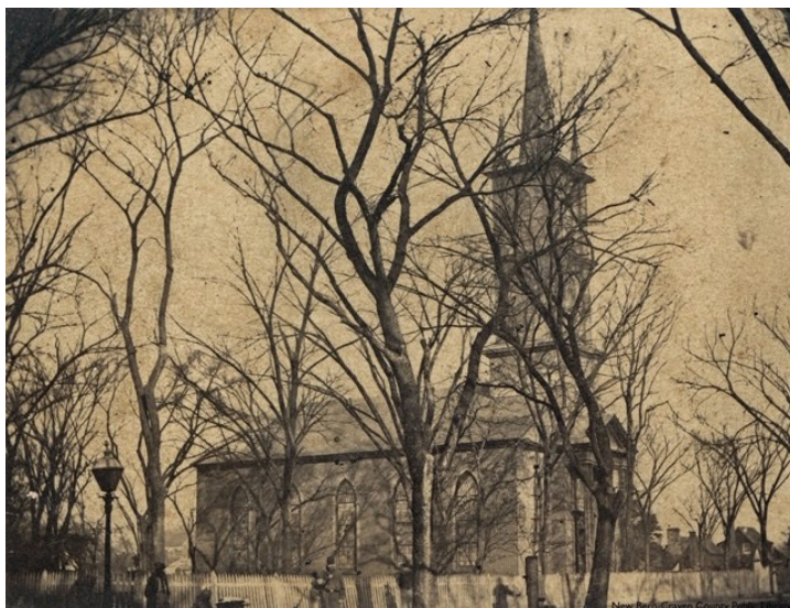
Christ Episcopal Church, c. 1865

Although the rebuilding of the church moved slowly, by April 1873, the church was able to host a visit from the bishop, as well as the Easter services. Additional work on the church would continue for the next 12 years, with the porch being completed in 1884 and the spire in 1885.”