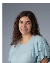
Gray Proctor Nursery