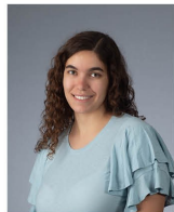
Gray Proctor Nursery